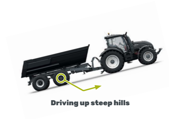
Driving up steep hills