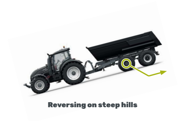
Reversing on steep hills