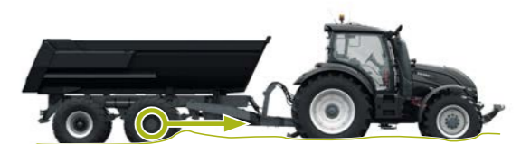
Driving on slippery or soft surfaces